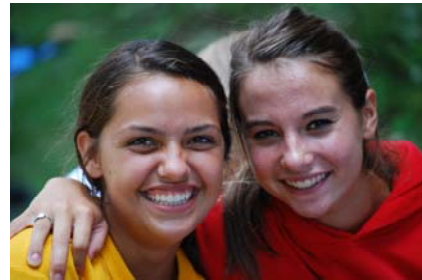
Posing before getting to work!

In 2010, ReCreation Experiences partnered with a total of 1163 volunteers representing a total of 52 teams from 13 states. The volunteers consisted of church youth groups representing the Methodist, Presbyterian, Episcopal, Catholic, Multi-denominational, Evangelical Free, Lutheran, Baptist, Evangelical Friends, Non-denominational, Interdenominational, and Disciples of Christ denominations. Again, Westlake UMC was the farthest team traveled, coming from Austin, TX 1156 miles away. The closest team traveled was Munsey Memorial UMC from Johnson City, TN just 53 miles up the road. Our largest team of volunteers came from Peachtree Road UMC from Atlanta, GA with 71 participants. The smallest team was from the Holy Comforter Episcopal Church in Charlotte, NC with 5 participants. 68% of the volunteer teams were returning groups.